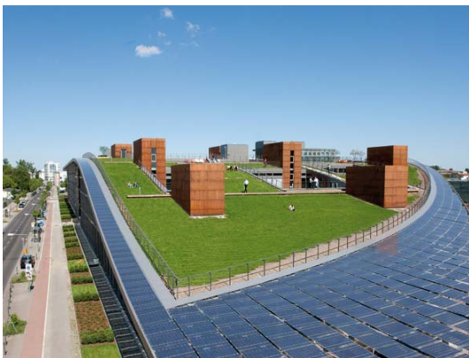
File name: Solon_Dachlandschaft.jpg

With an area of 3000 m 2 , the pitched roof of the SOLON SE office building in Berlin-Adlershof provides functional green areas and terraces for its staff.