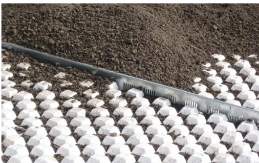
File name: IMG_0935.jpg

The ZinCo Floraset® FS 75 drainage elements are installed, between the shear barriers, onto the thermal insulation layer and are then covered with substrate.