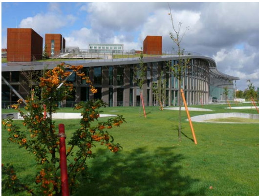
File name: P1770951.jpg

Please acknowledge relevant source when using photo material!