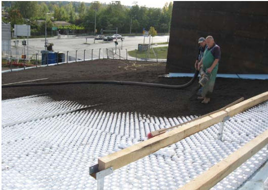
File name: IMG_0918.jpg