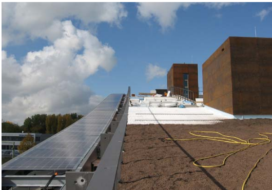
File name: IMG_0944.jpg

The substrate is piped up to the roof through the silo vehicle pipe and is distributed as required. In the foreground, the steel sub-structure for the wooden pathway yet to be installed.